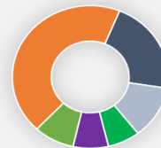
GEOGRAPHICAL DISTRIBUTION OF INSTITUTIONAL INVESTORS